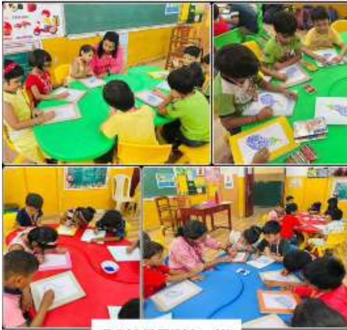
BALVATIKA - III