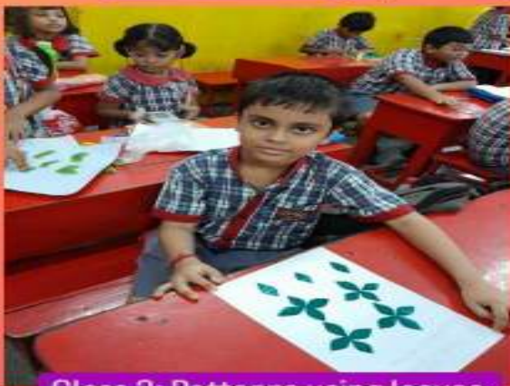
Class 2: Patterns using leaves