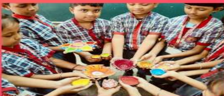
Class 3: Handmade diyas before Diwali 🪔