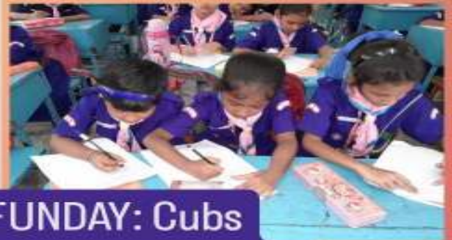
FUNDAY: Cubs and Bulbul activities