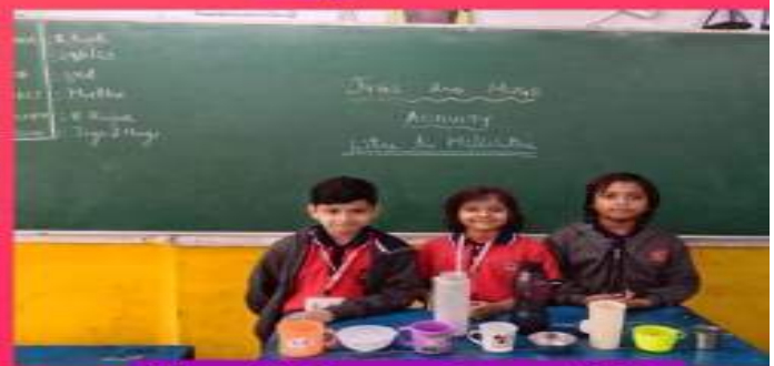
Class 3: Measuring activity (Learning by doing)

"Tell me and I forget, teach me and I may remember, involve me and I learn."