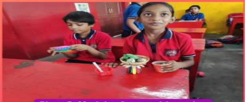
Class 2: Models of vegetables using clay