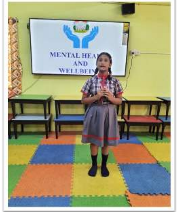
Elocution by the students of class 5 on 10 th October on Mental Health Awareness Day