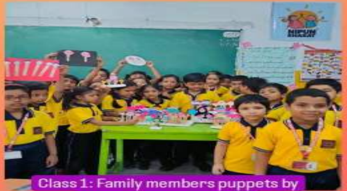
Class 1: Family members puppets by using ice cream sticks