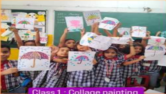
Class 1 : Collage painting