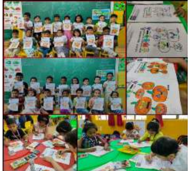
BALVATIKA -III (31-10-23)