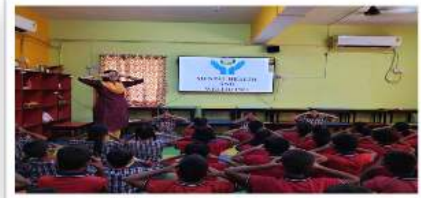
Gratitude note by the students of class 3 on mental health awareness week and Yoga demonstration by class 4 A with the help of the yoga teacher