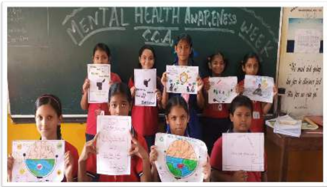
Poster making by class 5 during Mental Health Awareness Week