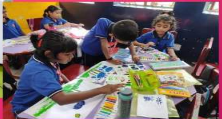
Drawing & Painting

FUNDAY ACTIVITIES provide students a new outlook towards life and learning.